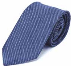
BLUE DOT TP140