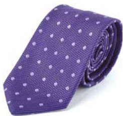
PURPLE DOT TP152